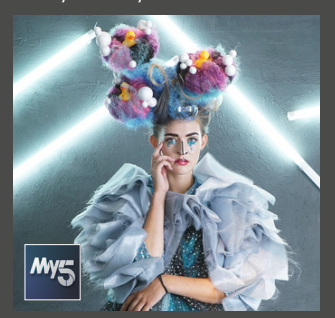
EXTREME HAIR WARS