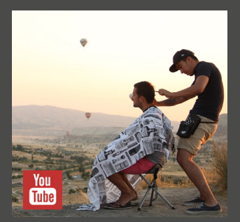
THE NOMAD BARBER