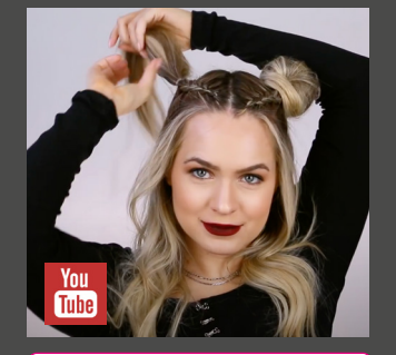
6 FESTIVAL HAIRSTYLES