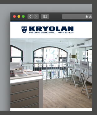
KRYOLAN PROFESSIONAL MAKEUP